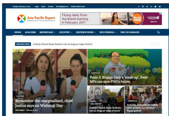
Figure 3. An Asia Pacific Report front page online featuring Waitangi Day; corruption in Papua New Guinea, the Catholic Church condemning Philippines President Duterte's 'reign of terror' which has already led to 7600 assassinations in seven months; and Australia and Indonesia discussing cyber-security but failing to address West Papua. APR 6 February 2017.

Establishing this opportunity of reach and the opportunity to create a contemporary online environment where the PMC and AUT Asia-Pacific students can apply and develop their talents was a key factor driving Asia Pacific Report within a rich learning environment. Our website policy declared that the focus was students reporting on 'a range of Asia-Pacific issues ranging from climate change and the environment to education and health to politics, media, law social justice and sustainable business'. 32 The New Zealand reportage is in partnership with students at the