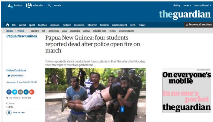
Figure 5: Helen Davidson's article in The Guardian wrongly headlined 'Papua New Guinea: four students reported dead after police open fire on march', 8 June 2016.

dia, such as Loop PNG and PNG Today , and citizen journalists, including one senior academic staff member at UPNG who supplied us with regular quality images. 50