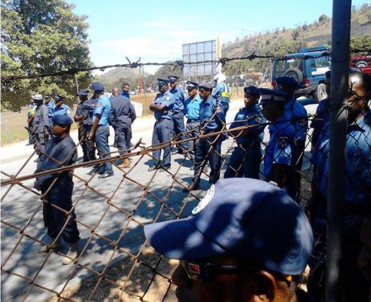
Figure 1: Papua New Guinea police blockading the entrance to the University of Papua New Guinea, where Uni Tavar was published and where Asia Pacific Report has a network of correspondents.

Production course at AUT in 2003-2007 and I have written extensively about this experience elsewhere. 28