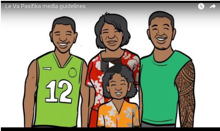
Figure 6: Le Va's Pasifika media guidelines 'whiteboard' video embedded in Asia Pacific Report's articles related to the Samoa Observer transgender suicide controversy, June 2016.

Asia Pacific Report had no solutions either, but rather than joining the 'blame game' that many media indulged in, stirring even greater offence, this news website and its sister project, Pacific Media Watch, attempted to treat the editorial blunder as a learning experience and to embed constructive video resources and links available to Pacific journalists (Figure 6). Pasifika media can play a key role in leading 'safe messaging' about reporting suicide to Pacific communities. In partnership with Pasifika media in